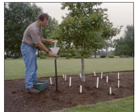
Figure 4.—Filling holes with fertilizer.