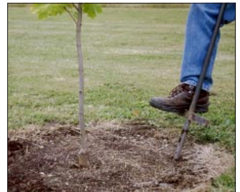
Figure 3.—Using a punch bar to dig holes.